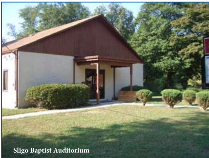
Sligo Baptist Auditorium

Please pray that God would continue to use this missionary church planter and his family to restart Sligo Baptist Church and reach this needy mission field near our nation's capitol city.